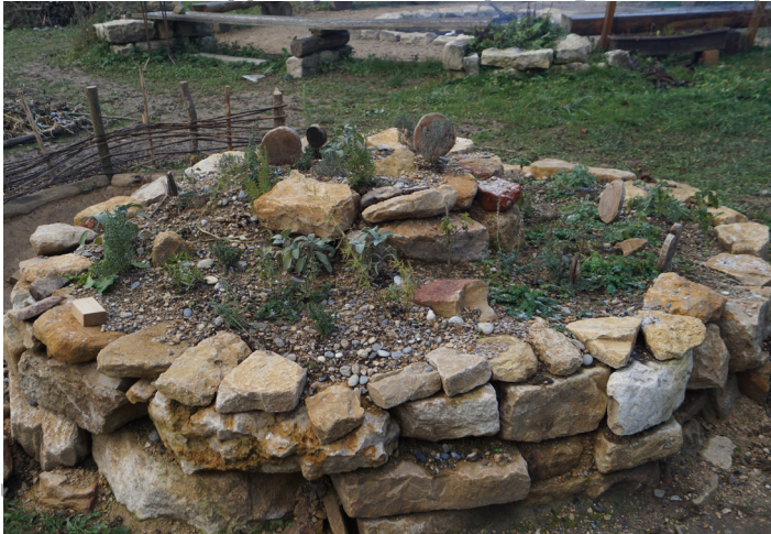
The herb snail in the garden, planted with thyme and co.

At the village brook in the Vauban district, the zusammen garten is located. Since July 2016, many small ideas have come together on a plot with an area of approx. 3500 square meters. The garden is mainly divided into two large sections: The first section consists of small garden plots, which are arranged crescent-shaped. This part of the garden is used privately. Anyone who would like to participate in the project can plant and design his/her own plot here. Whatever the plot in the end throws off can then be kept for personal use. The second large section of the garden consists of a communal garden, which is also groomed and peeled collectively. Unlike the individual parcels, the harvested vegetables are also used for joint cooking events or for „zusammen Kaffee’s“ joint table.